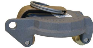
305C (2") low profile handle