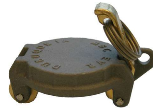
305C (2") standard handle