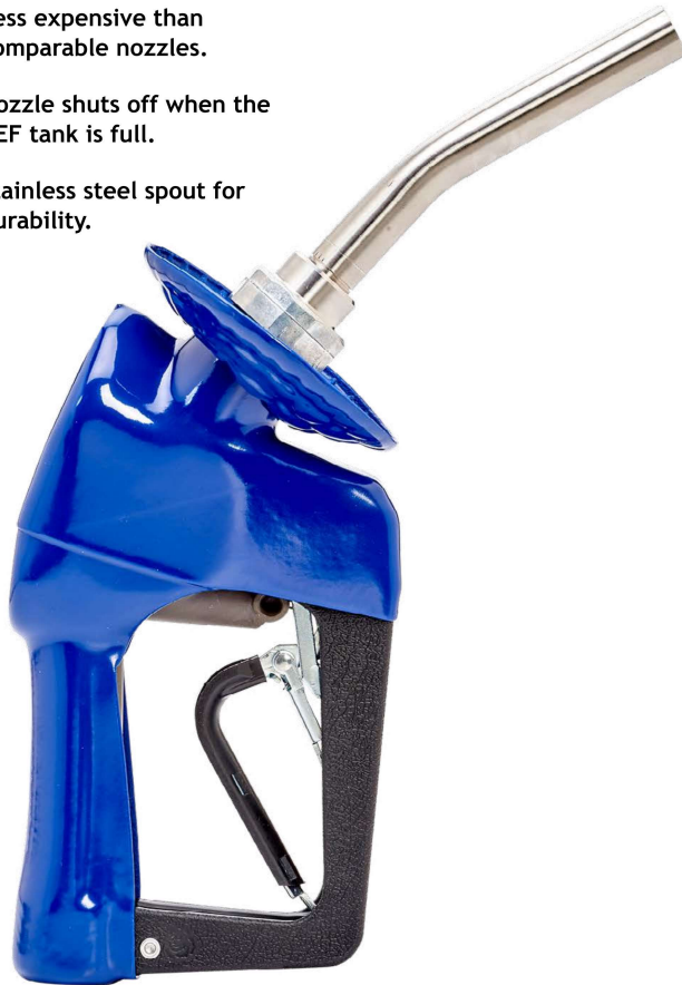
X DEF Plastic Nozzle Back Pressure Performance